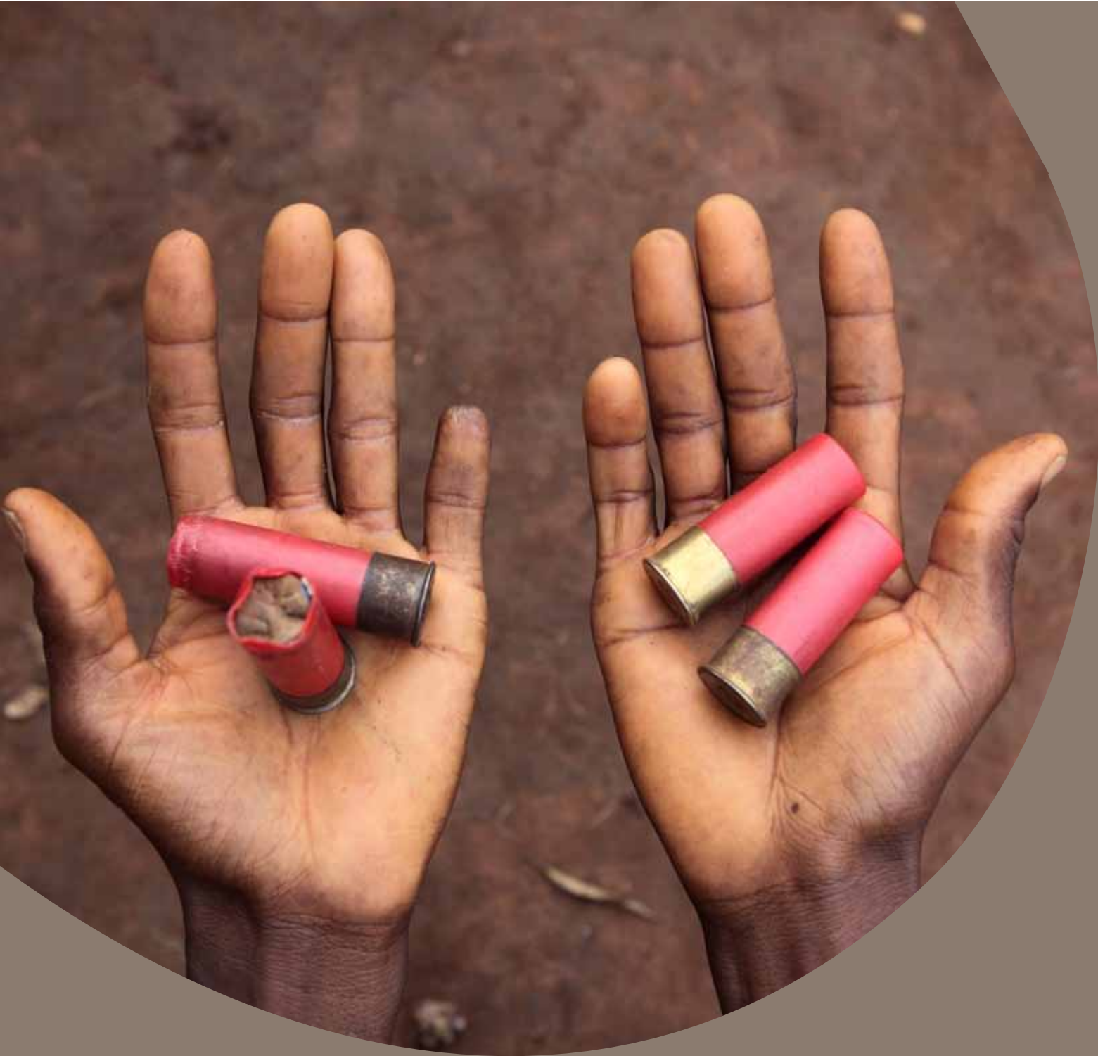
A self-defence group's homemade ammunition, which consists of match heads and lumps of metal. It can be dangerous to manufacture and this man lost a fingertip while making them.