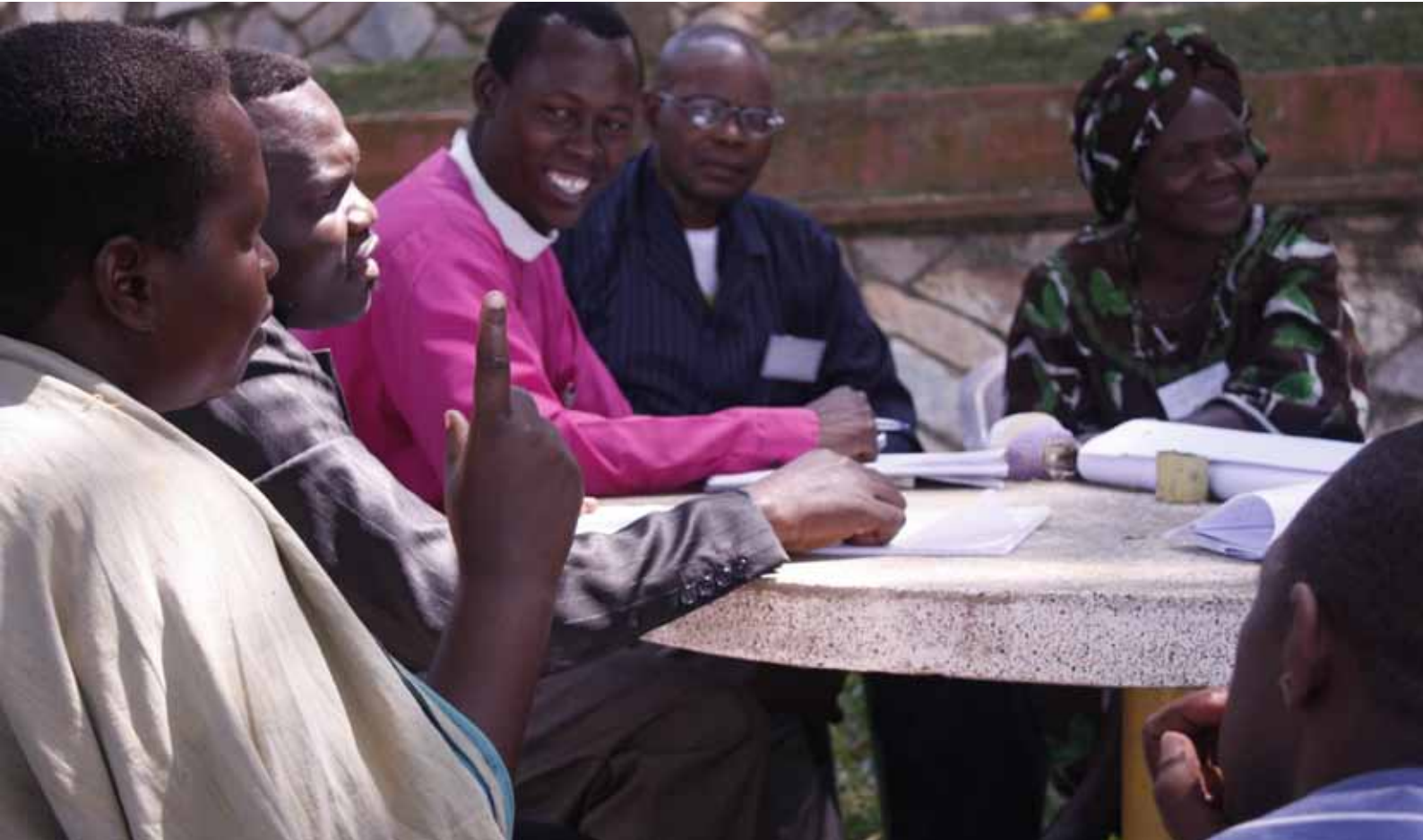
Photo shows cultural and religious leaders from Uganda, CAR, DRC and South Sudan meeting to discuss the LRA (as part of the Regional Civil Society Task Force), Entebbe, July 2011.

multiple dimensions of the conflict, in order to achieve a sustainable end to the LRA conflict. Those who have to live with the conflict and its consequences are committed to using the peacebuilding tools of dialogue and engagement with the LRA.