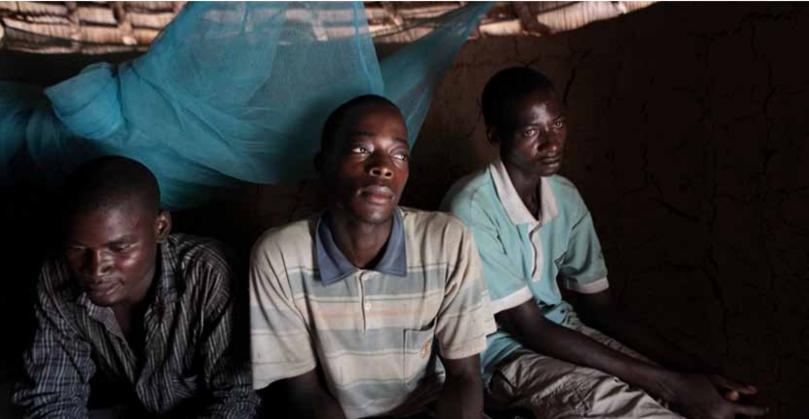
Three former LRA abductees, Democratic Republic of Congo.

‘Nobody has been to the forest to count the LRA.’