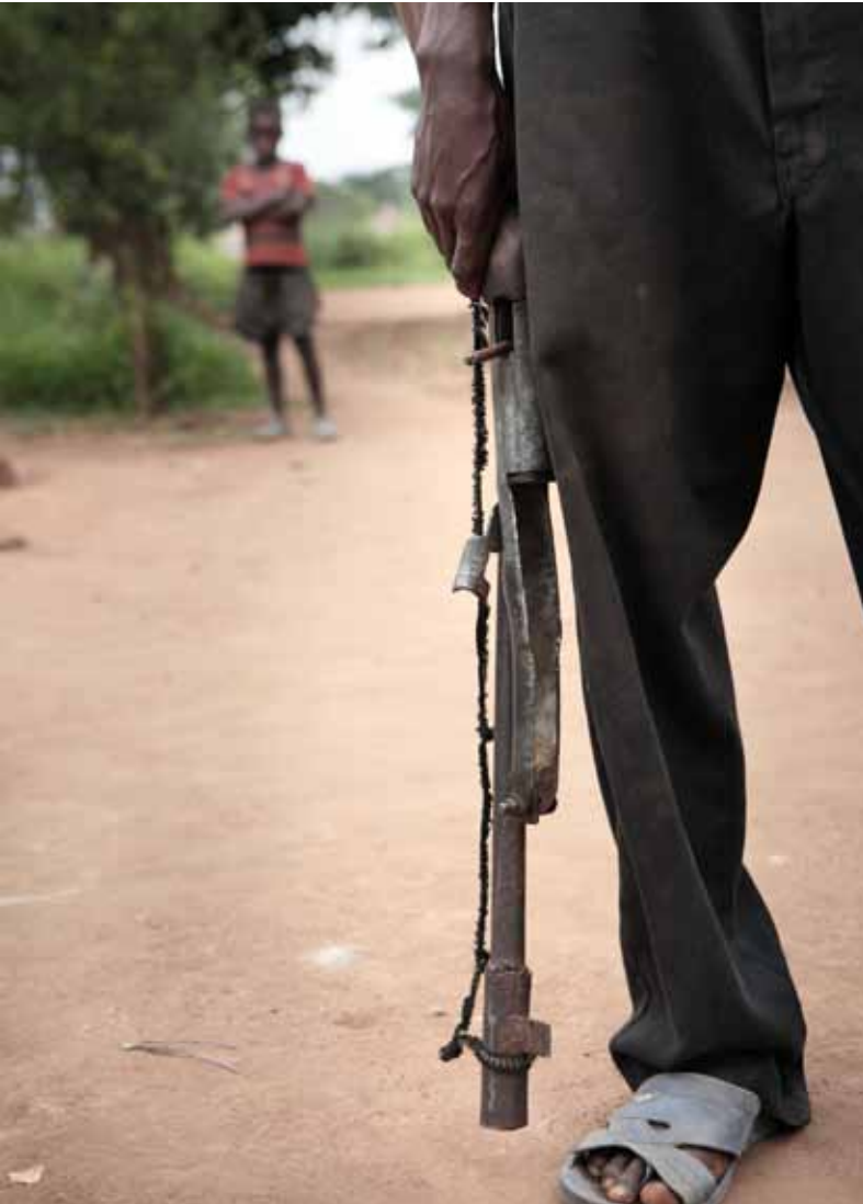
A member of Doruma's self-defence group holding a homemade gun.

Kabila called for the UN peacekeepers to start withdrawing as of June 2010, with a complete withdrawal of the remaining 19,000 troops by August 2011. The UNSC resisted the call, but both parties settled for reduced troop levels. This has resulted in a reduced UN presence in the LRA-affected Uélé districts.