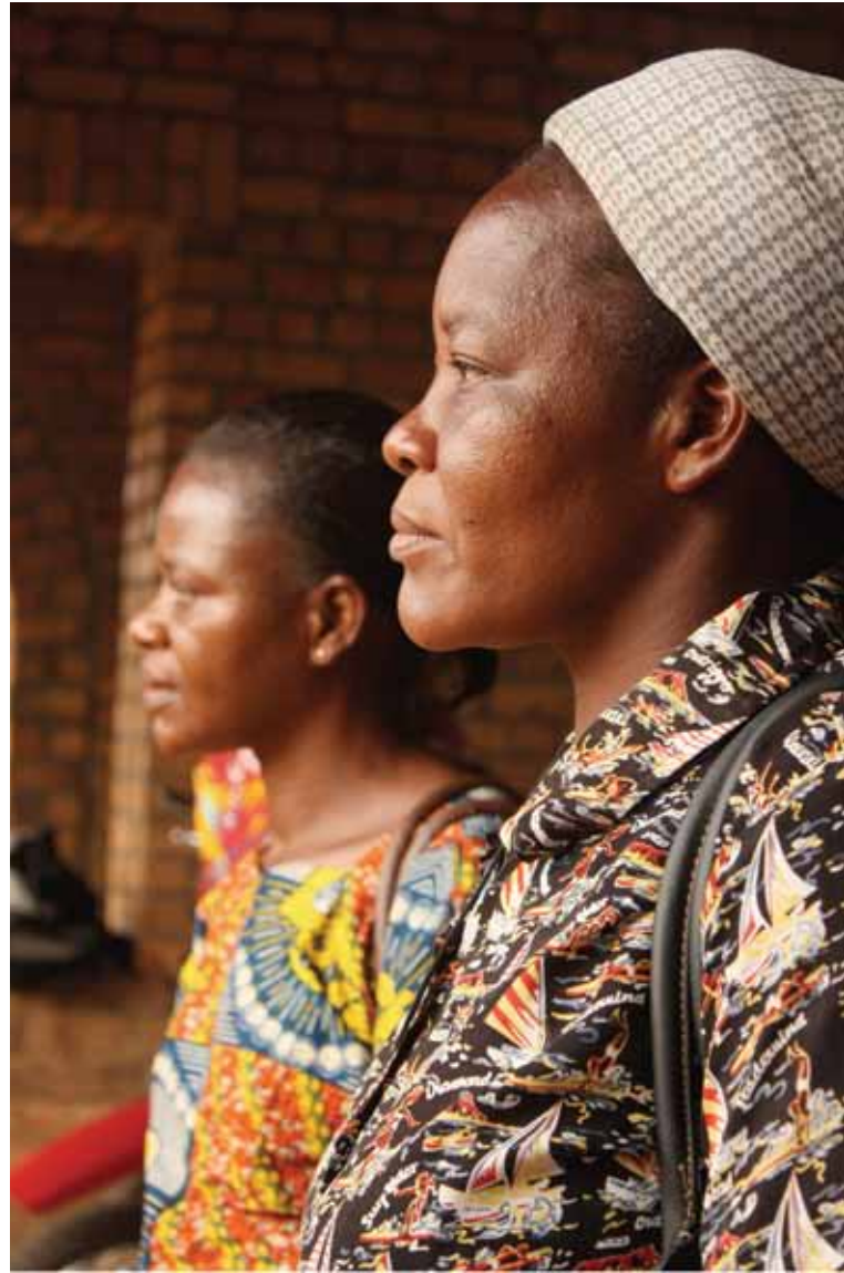
Meeting of the platform of women’s organisations in Dungu, DRC, May 2011.

Displacement has had a severe impact on livelihoods. People have had to abandon their fields to move to the relative safety of towns or