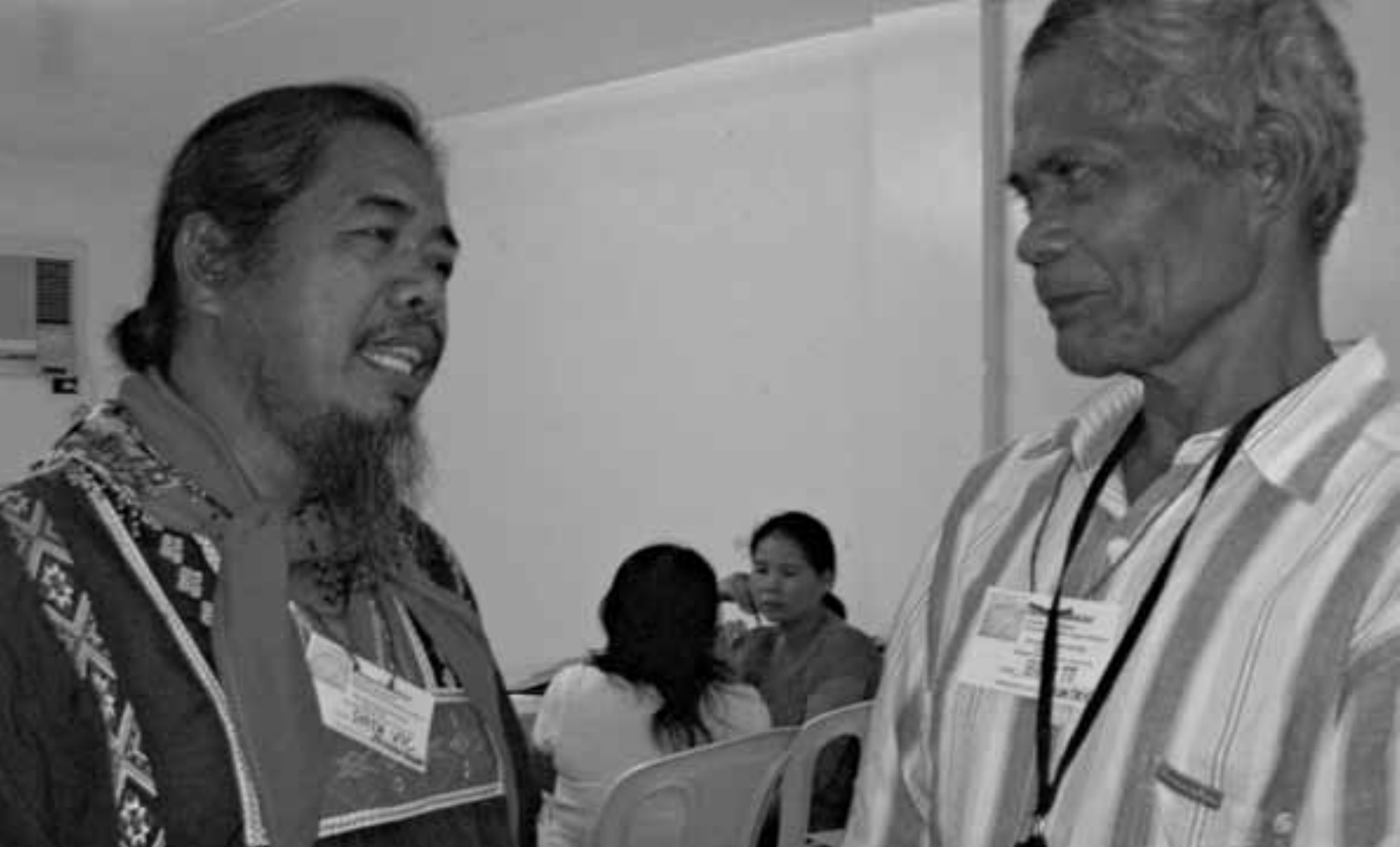
Participants talk informally during the workshop in Mindanao, the Philippines.