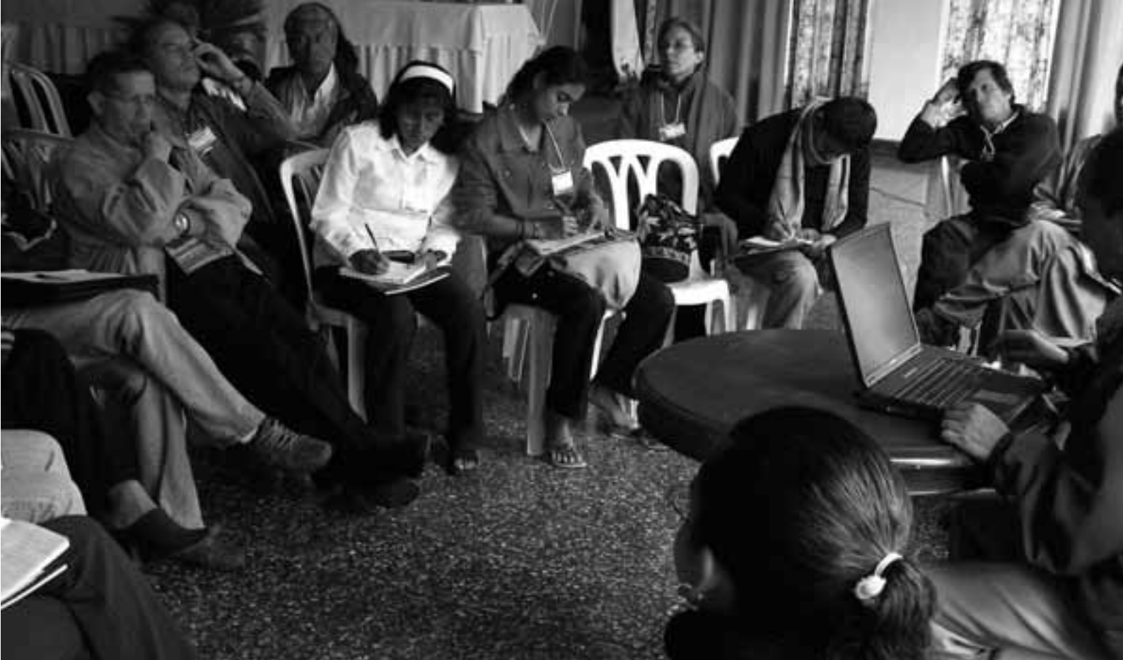
Working groups at the INDEPAZ – CR seminar in Popayán, Colombia.

and damage its potential to act as a third party. An example was given of a group in the Caucasus that tried to carry out a rigorous analysis of the nature of the conflict, but in doing that was always in danger of being identified with one community's understanding of the situation, especially as the members of the group came from that community.