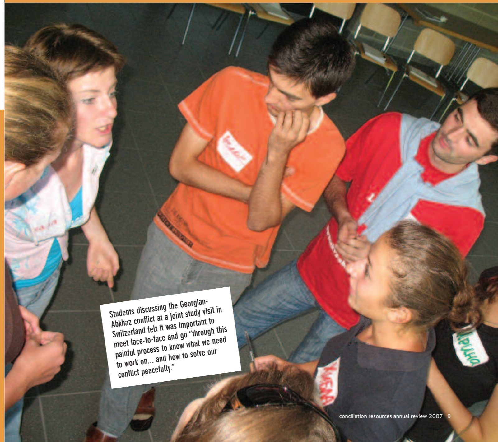
Students discussing the Georgian-Abkhaz conflict at a joint study visit in Switzerland felt it was important to meet face-to-face and go "through this painful process to know what we need to work on... and how to solve our conflict peacefully."

As potential advocates for tolerance and peace, young people will remain a focus of our work in 2008.